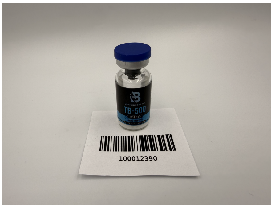
Photo of the test sample

The test sample was applied in the amount of 3 \mu l to the BioBasic 8 Thermo Scientific column. During the course of the analysis with the method a linear gradient in the solutions of H 2 O and Acetonitrile with the addition of 0.1% trifluoroacetic acid, a peak of the sought substance appeared. Its content, when compared to the reference chromatogram, is 10,23mg. Height the measurement error is + - 0,05mg. The actual state of the sample sent before the test is presented on the photo below